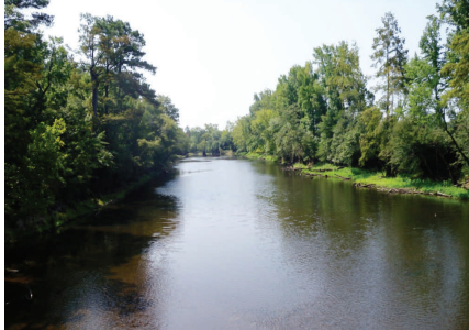
Nottoway River at Carys Bridge

miles of the Nottoway River will be included in the Scenic Rivers program.