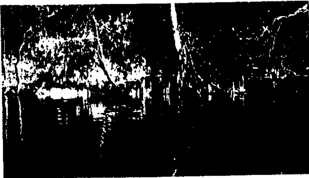
Icicles On The Nottoway