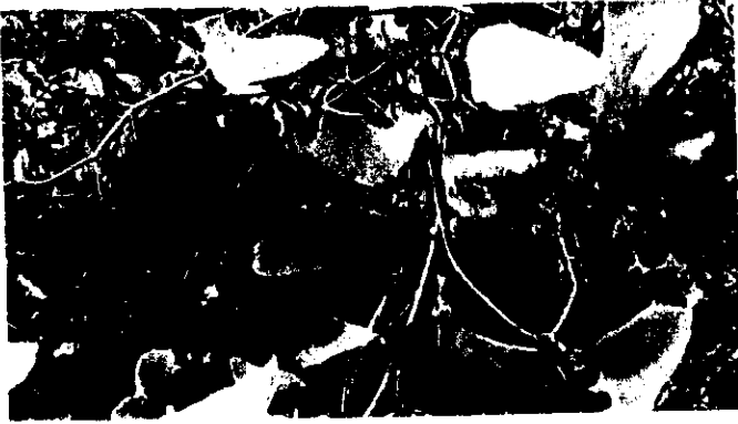
Fall Colors On The Blackwater