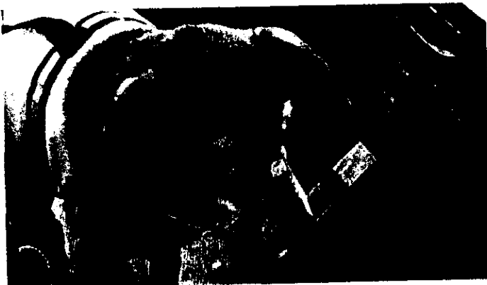
Moonpie With A Blackfish Scale On Her Nose