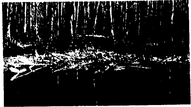
Beaver Hut & Food Storage